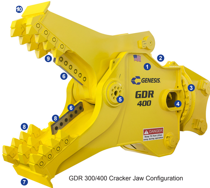
GDR 300/400 Cracker Jaw Configuration