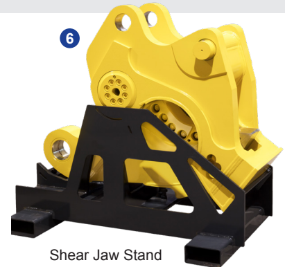
Shear Jaw Stand