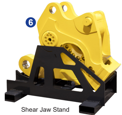
Shear Jaw Stand